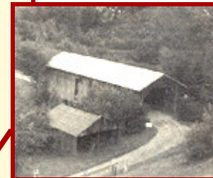
6. Hutchins Bridge 1883 Hutchins Bridge Rd