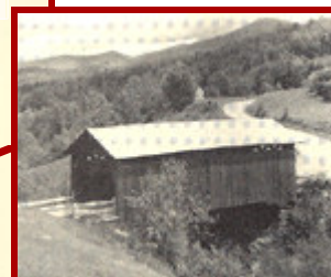
7. Hectorville Bridge 1883 Gibou Rd Removed / In Storage