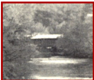
2. Longley Bridge 1863 Rte 118 & Longley Brdg Rd