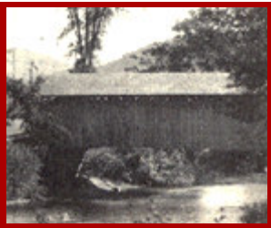
1. Hopkins Bridge 1875 Rte 118 & Hopkins Rd