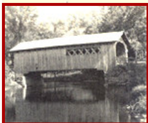
4. Comstock Bridge 1883 Comstock Bridge Rd