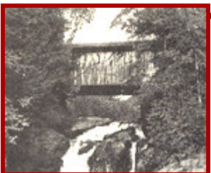
3. Creamery Bridge 1883 Go 2.6 miles on West Hill Rd then turn left on Creamery Bridge Rd