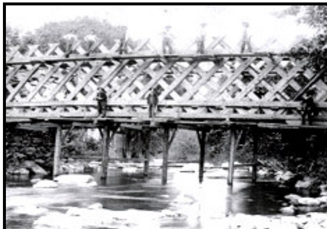
Comstock Bridge under construction

The brothers started by positioning the main bearing beams across the stream onto a pier foundation on each end. Next the trusses were moved into position and the top beams tied. Finally the roof was secured.