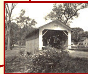
5. Fuller Bridge 1890 Fuller Bridge Rd